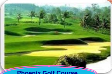
Phoenix Golf Course

Enjoy Your Stay at The Seaside In Thailand