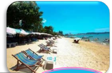
Tropical beautiful beach & condo-swimming pool .

The studio and apartment are located in the Somphong Condotel building. Situated in the charming, rustic fishing village of Ban Amphur.