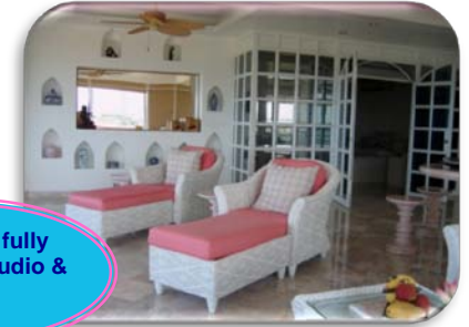
Luxuriously fully furnished studio & Apartment.

Thailand marble room rentals At Ban Amphur Beach, Thailand